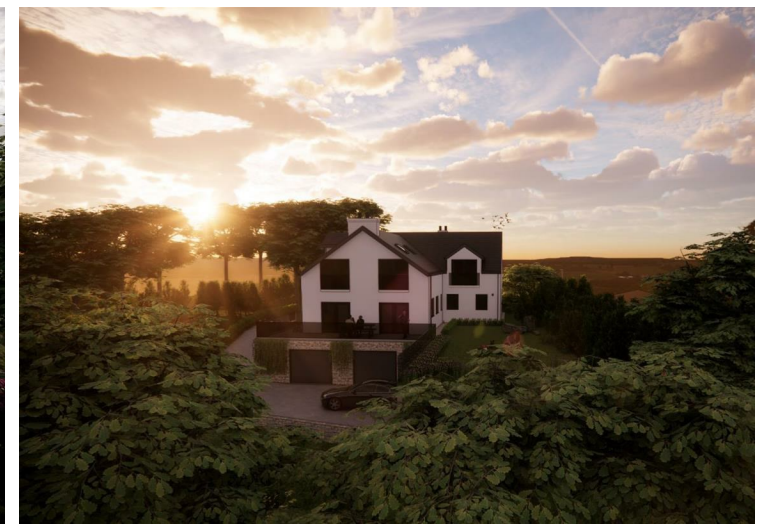
**CGI Images show potential build**

An opportunity to purchase a generous plot located in an elevated position on the outskirts of Keeton. Measuring approximately 0.7 acres, the plot currently houses a detached two-bedroom property which is in need of modernisation but has the potential for renovation and extension.